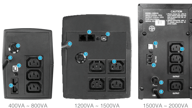
400VA ~ 800VA